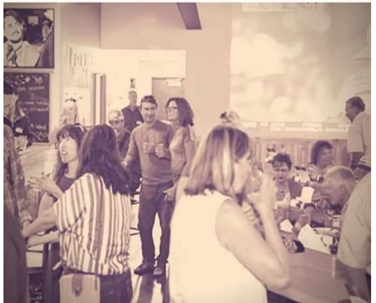
Old picture of people eating in a restaurant back in 2019